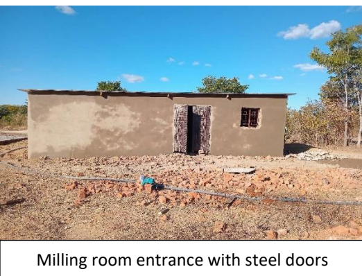
Milling room entrance with steel doors

Christ United Methodist Church Attn – TNC HOH Poultry/Grain Storage Project 44 Highland Road Bethel Park, PA 15102