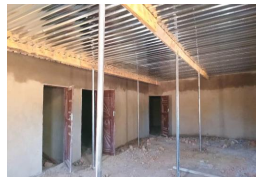
Storage room entrances from milling room

To contribute to this project, you can use the PayPal link on the TNC website: https://www.nyadire.org/donate.html (Please